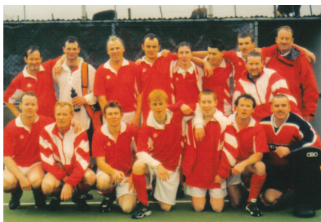
DIVISION 2 PREMIERS 2003