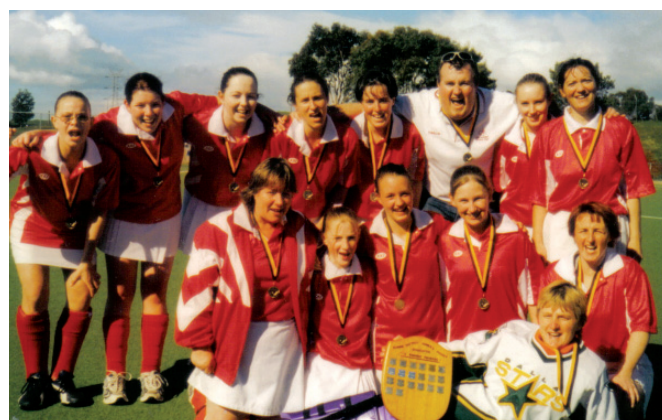
DIVISION 3 PREMIERS 2003