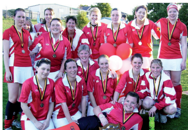
DIVISION 2 PREMIERS 2007