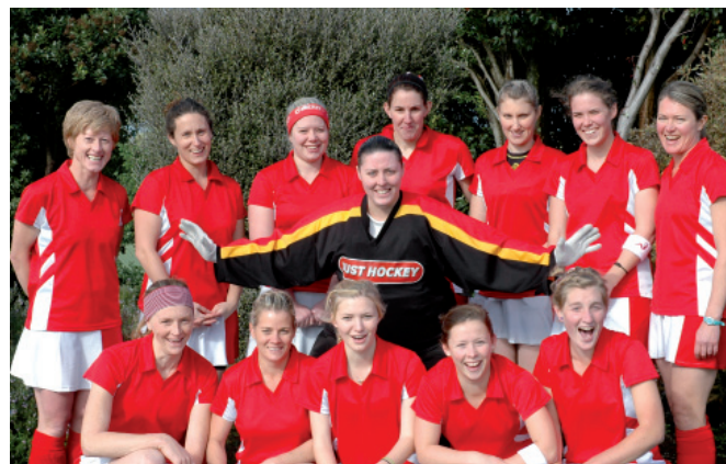
DIVISION 1 TEAM PHOTO 2009