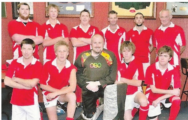
DIVISION 3 TEAM PHOTO 2012