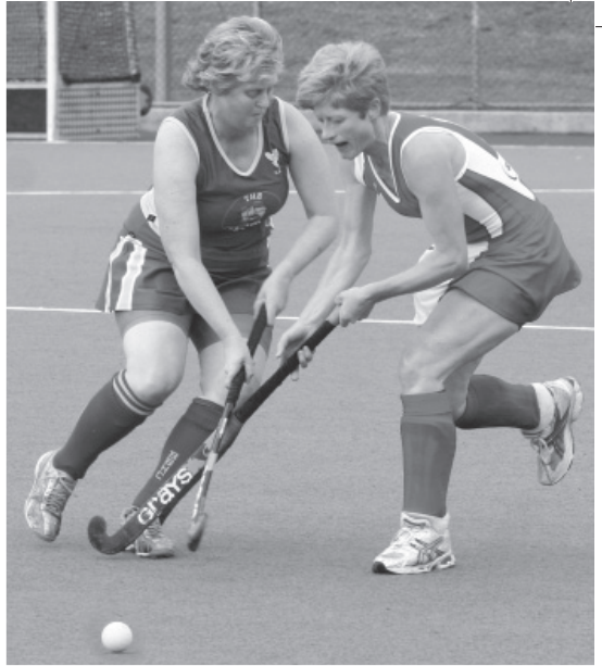
la Park Regional Hockey Com