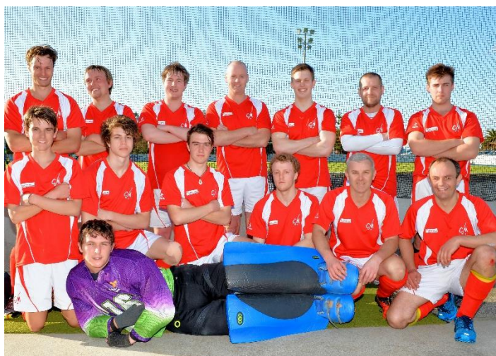
Div. 1 men

Donated by My Jewellers Donated by Cyclad Burnie