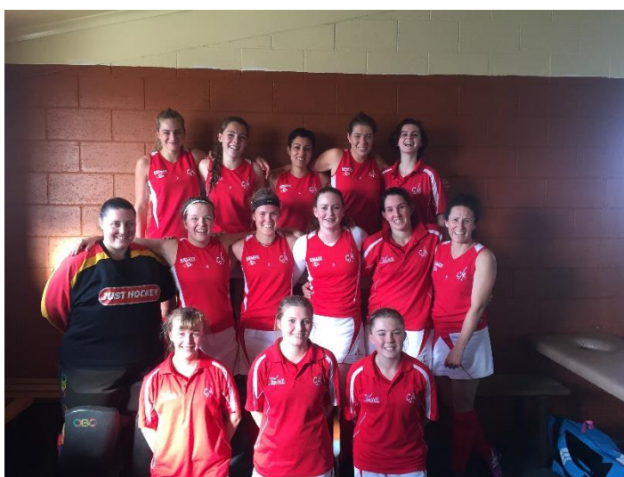
Div 1 Women