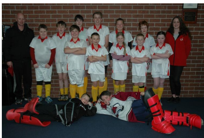
Under 13 WHITE